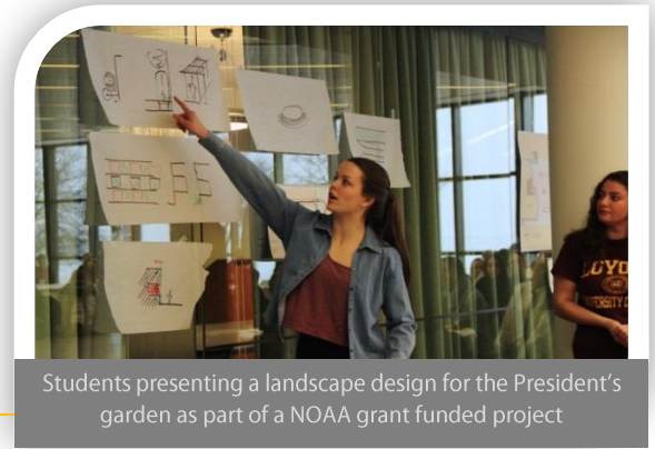
Students presenting a landscape design for the President's garden as part of a NOAA grant funded project

Sustainability is one of Loyola's key initiatives exemplifying our unifying value of social justice. Sustainability Across the Curriculum is an initiative of Loyola University Chicago to promote sustainability in the academic endeavor as a part of our social justice mission.