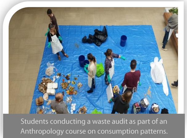
Students conducting a waste audit as part of an Anthropology course on consumption patterns.