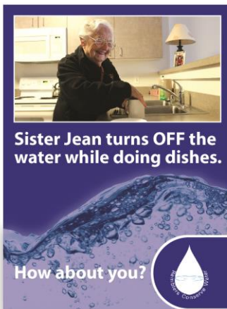
One of the persistent feedback tools encouraging student water efficiency